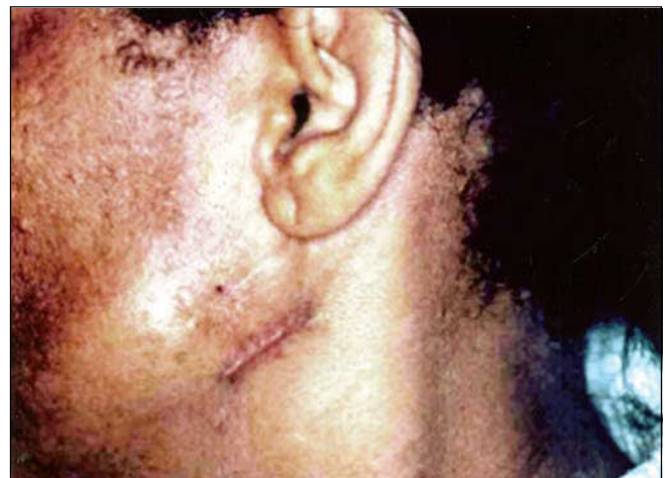
Figure 2. Small tumor in parotid region (3rd lesion). We can also observe the surgical scars of previous lesions removed.