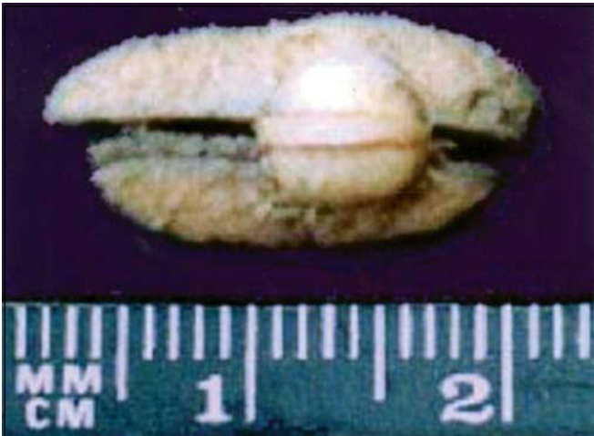
Figure 1. Aspect of cutaneous nodule removed from the dermis of submandibular region (2nd lesion).

parotid, we can consider the following diagnostic hypotheses for differential diagnosis: 1) metastasis of breast ductal carcinoma owing to the presence of apocrine differentiation that may take place in the tumor, in addition to the fact that the breast is a frequent site of primary tumor in infraclavicular anatomical location, generating metastases to the parotid 7,8 ; 2) metastasis of cutaneous apocrine carcinoma that has marked apocrine differentiation 5-7 ; 3) salivary gland ductal carcinoma, whose basic aspect is to have some similarities such as the fact that neoplastic cells present abundant eosinophilic and granular cytoplasm, with increased nuclei and prominent nucleoli, forming micropapillary arrangements or comedo-necrosis foci 9,10 ; and 4) renal cancer metastases, in which neoplastic cells also have abundant eosinophilic and granular cytoplasm, which can also present areas of papillary differentiation 7,8 .