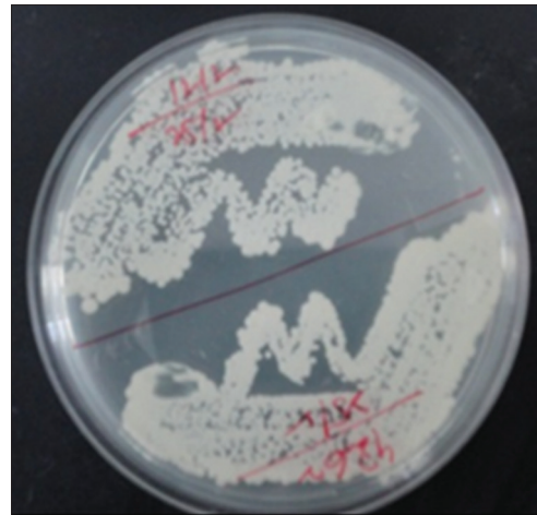
Figure 2: Colonies of Candida species