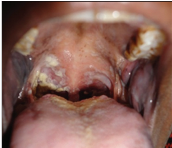
Figure 1: Human immunodeficiency virus seropositive patient with evidence of oropharyngeal candidiasis