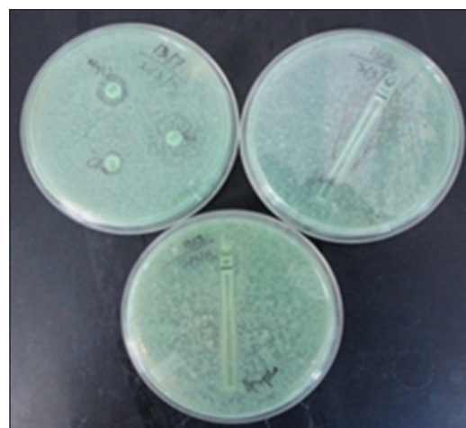
Figure 6: Candida colonies showing resistance to all selected antifungal drugs

pseudomembranous (oral thrush), atrophic (erythematous), angular cheilitis or hyperplastic candidiasis. [1] The advent of