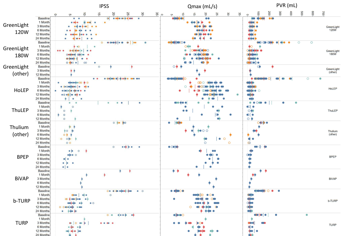
Figure 1 Mean and median baseline and follow-up IPSS score, Qmax (mL/s), and PVR (mL) over time, by intervention group and primary high-risk category. Different colours indicate the different population risk groups. Filled in circles are mean values and outlined circles are median values. Horizontal lines represent the weighted averages.

Some differences were seen in the response to different interventions across high-risk subgroups. Patients with large prostate glands showed a significant reduction in IPSS scores across treatment modalities, with no major differences in durability. In men with indwelling catheters, post-operative IPSS was good across all modalities, with greater heterogeneity of IPSS response to GreenLight 180 W compared with other treatments at the 1-month and 3-month time points but generally being a little higher than other modalities at 6 months and 1 year. Holmium laser enucleation of the prostate (HoLEP) and bipolar enucleation therapies demonstrated the best sustained reduction in IPSS at 24 months; however, data for bipolar enucleation were limited (Table S8).