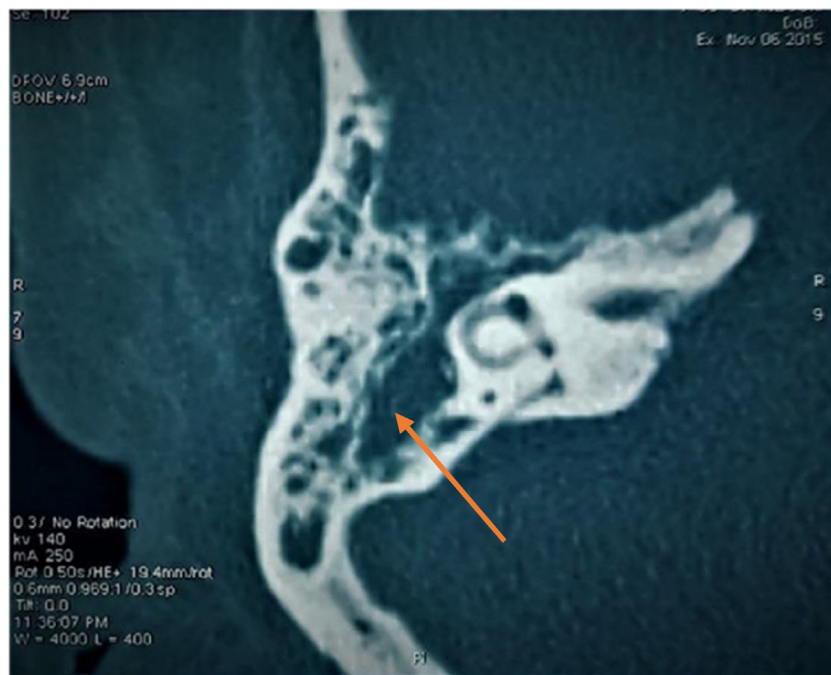
Fig. 3. Subtotal filling of the middle ear.

It has been suggested that S. zooepidemicus is potentially more virulent than other subspecies of the group [1]. Previous studies have demonstrated that S. zooepidemicus carries antigens with antiphagocytic characteristics similar to the M proteins expressed in Lancefield group A and G streptococcal. It is named the M-like