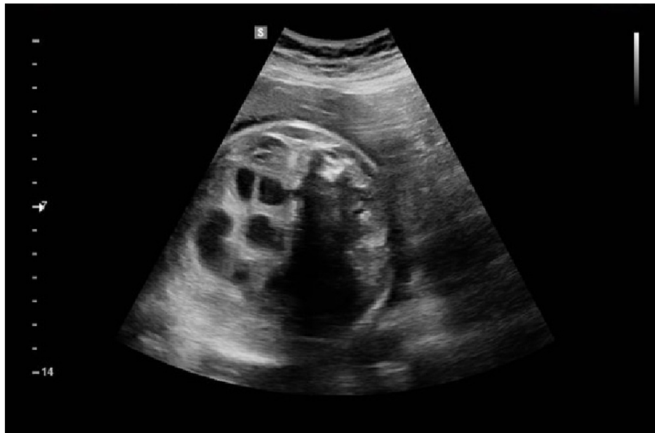
FIGURE 1: Antenatal ultrasound at 31/40 gestation showing normal calibre of distal bowel with dilated proximal bowel loops

A laparotomy via a transverse supraumbilical incision was performed. An intestinal malrotation with a narrow mesenteric base, with a PDPV crossing anterior to the second part of the duodenum, and a Type II (Grosfeld classification) jejunal atresia of approximately 5mm in length (Figure 2 and 3) were noted. As there was no suggestion of duodenal obstruction, an intraoperative decision was made to not perform a gastro- or duodenoduodenostomy to correct the PDPV. A Ladd's procedure with appendicectomy was performed, the atretic jejunal ends were resected and an end-to-end anastomosis performed using 6-0 polydioxanone seromuscular sutures. The eviscerated bowel was returned to the abdomen in a non-rotated orientation.