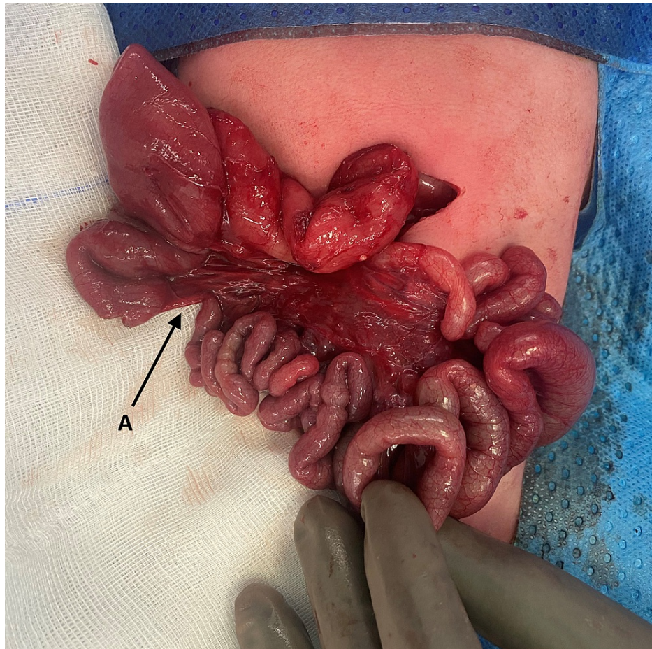
FIGURE 2: Intraoperative photograph demonstrating the initial finding of a Type II jejunal atresia (A)