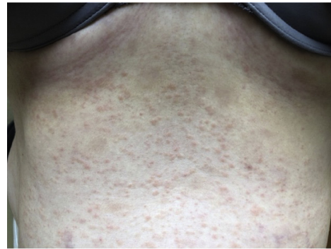
Fig 4. Erythematous, edematous papules scattered across the abdomen.

The patient is a 37-year-old man with no past medical history who presented with an eczematous dermatitis shortly after receiving the COVID-19 vaccine. The patient noticed faint pink, scaly plaques on his eyelids and arms within 7 days of the first dose of his Pfizer vaccine. The patient noticed a similar, more dramatic rash after the second dose of his Pfizer vaccine (Fig 5). The symptoms associated