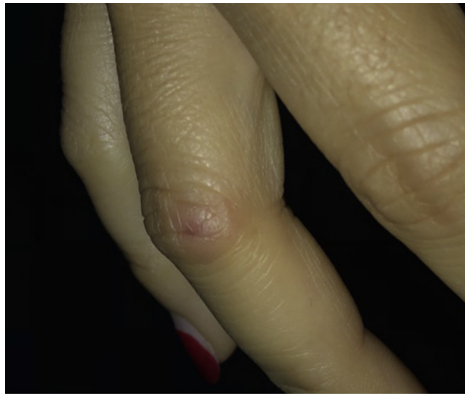
Fig 3. Subtle chilblains-like erythematous-to-blue dermal papules overlying the joint spaces of the hands.

eruption. The patient received her first dose of the Moderna vaccine and the second dose 4 weeks later. One day after the second dose, she developed a morbilliform rash consisting of erythematous, edematous papules coalescing into plaques on her trunk with eventual spread to her extremities and face (Fig 4). She endorsed pruritus and burning at the areas of involvement. The patient had no history of previous COVID-19 infection, no history of other dermatologic conditions, nor previous allergic reactions to injectable medications or vaccinations.