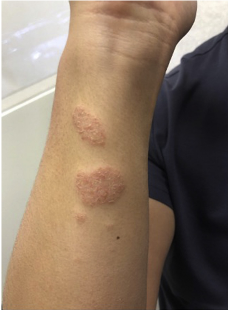
Fig 5. Pink, round plaques with fine overlying scale on the right forearm.

to 60 years of age (average, 44 years) in the study by McMahon et al. 11