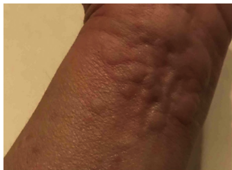
Fig 1. Faintly erythematous, edematous grouped wheals on the volar wrist.

her Moderna vaccine. The angioedema was short-lived, persisting for several hours before resolving with a patient-initiated one-time dose of oral diphenhydramine. The urticarial rash persisted for 3 days and resolved, again, with patient-initiated baking soda baths. The patient did not have a known COVID-19 infection prior to vaccine administration. Additionally, she had no prior history of skin disease, no prior history of cutaneous reactions after other vaccines, nor known allergies to injectable medications.