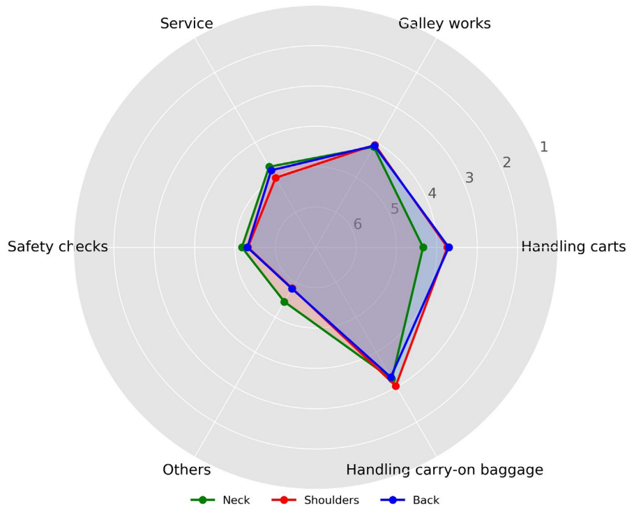
FIGURE 2 The relationship between tasks and three body parts