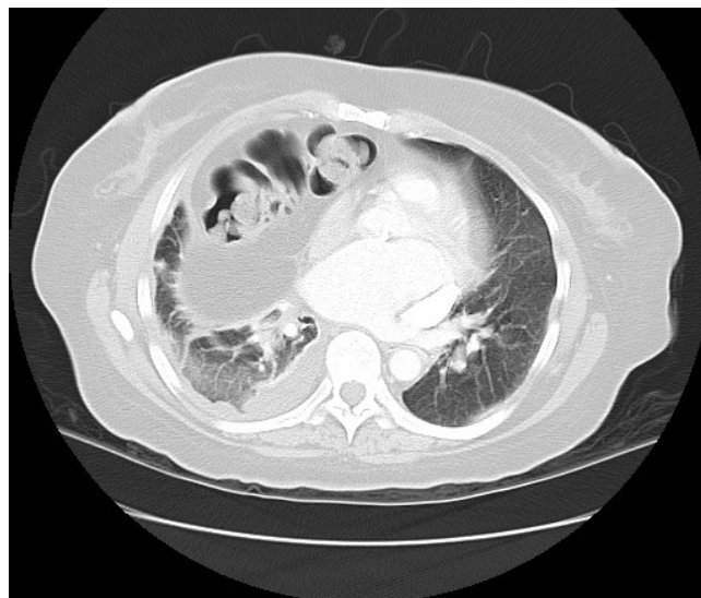
Figure 2 Axial computed tomography scan of the chest and abdomen demonstrating plate atelectasis in the right upper lobe presumably as a consequence of the long-standing right-sided anterior diaphragmatic hernia of Morgagni which displaces the heart to the left.

because of her small mouth, receding chin and short neck and she required a bougie to guide the endotracheal tube. In addition to her aortic stenosis, she also had a significantly dilated left atrium, mild mitral stenosis with mild regurgitation, pulmonary hypertension and markedly dilated coronary sinus. The left ventricle was concentrically hypertrophied and the ejection fraction was > 50%. The peak and mean gradients across the aortic valve were 52.7 and 29.5 mmHg, respectively. The electrocardiogram (ECG) showed sinus rhythm with partial right bundle branch block (RBBB) and minor inferior and lateral T wave changes. Despite her significant comorbidities, her persistent symptoms warranted surgical intervention and laparoscopic surgery was preferable to an open repair. So she underwent laparoscopic repair (Figure 3) of her congenital diaphragmatic hernia. Transverse colon and omentum were reduced from the right chest into the abdomen. Intraperitoneal gortex sutures were used to close the defect and the defect was reinforced with surgical porcine mesh and prolene. She made a quick and uneventful postoperative recovery.