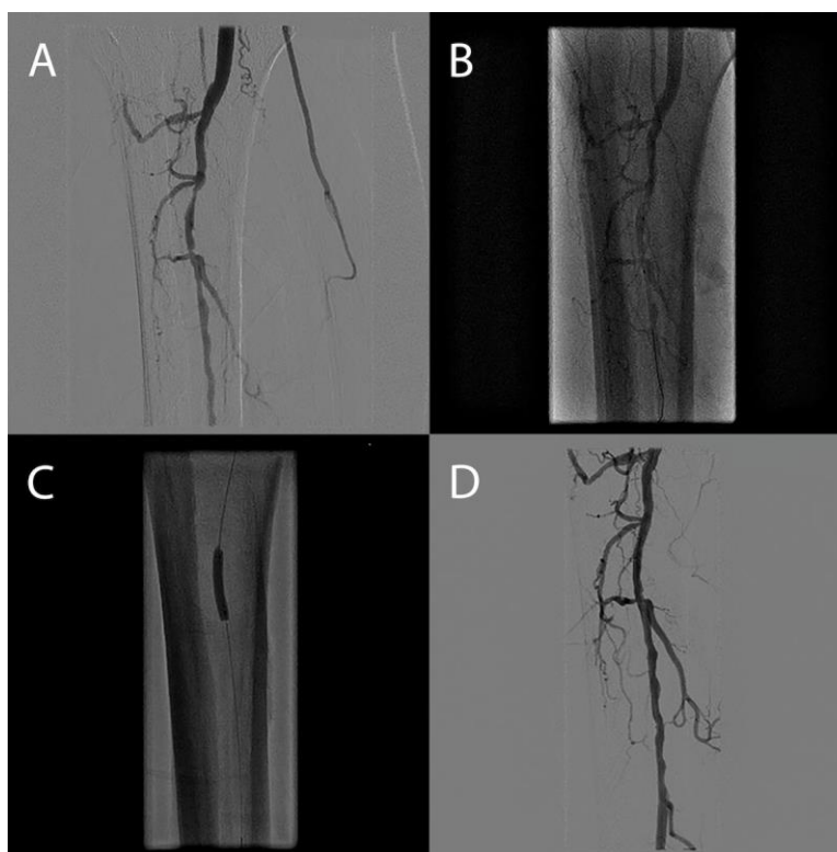
Figure 3. Right Lower Extremity below the Knee Robotic Revascularization.

more these lesions are ideal targets for robotic intervention with the currently available system. The size of the target infrapopliteal vessels typically requires the use of coronary interventional equipment including balloons and 0.014-inch guide wires, which are compatible with the current CorPath 200 system, and they are often treated with balloon angioplasty alone. Behnamfar et al. recently reported the first case of successful percutaneous management of below-the-knee PAD using robotically assisted balloon angioplasty with the CorPath 200 system. 40 Successful balloon angioplasty was performed using this system for a 56-year-old man with a focal stenosis in the tibioperoneal trunk and proximal peroneal artery. The procedure was performed without any complications, demonstrating that robotic PVI can be performed for below-the-knee disease (Figure 3). However, further clinical data are required fully to examine the safety and effective-