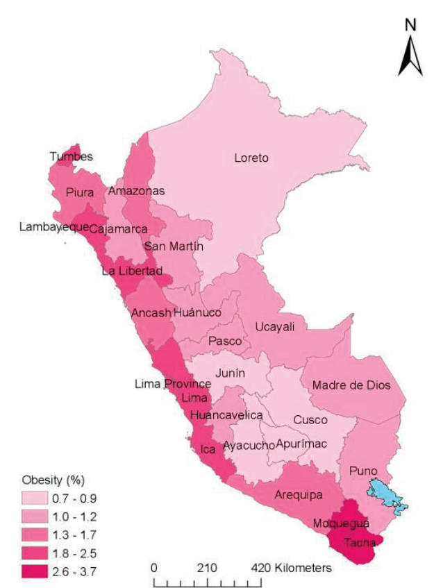
Figure 1. Prevalence of obesity in children under 5 years of age in Peru during the year 2017

in English that use in some way GIS (14). In this paper, the current state of obesity in Peru is looked into by presenting the spatial distribution of the prevalence of obesity across the country for the year 2017.