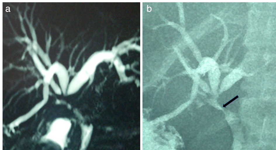
Figure 1 (a) Magnetic resonance cholangiopancreatography (MRCP) showing trifurcation of ducts at the confluence. (b) Percutaneous transhepatic cholangiography showing trifurcation of bile duct with internal biliary fistula (black arrow), which was not evident on MRCP.

recognized after 72 h following cholecystectomy. Three of these patients presented with a strictured hepatico-jejunostomy. All patients underwent the BBS repair elsewhere and presented after a mean duration of 5.6 years (range 1–9 years).