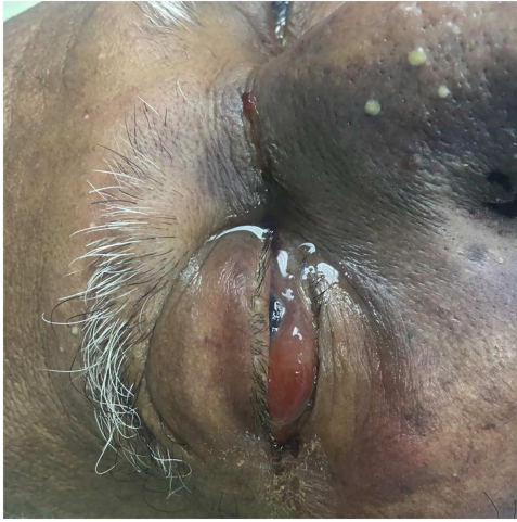
Figure 4: Image taken on the second day of admission. Note the spontaneous laceration (not noted on admission) extending from the edge of the right medial canthus to the bridge of the nose with no signs of bleeding and the worsening of the blackish discoloration of the midface and nose bridge.