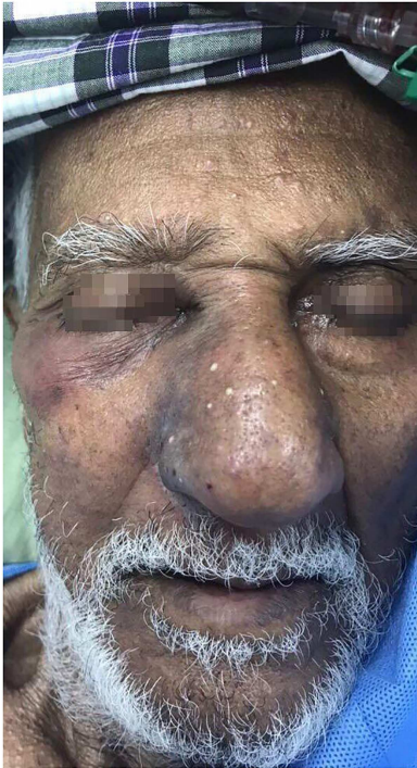
Figure 1: Image taken on initial presentation. Note the violaceous discoloration along the right zygomatic area with mild soft tissue swelling in that area; however, there was no obvious orbital involvement.

involvement of the infection worsened. A CT brain venography revealed poor enhancement of the right cavernous sinus (Fig. 3). A lumbar puncture sample was later found to be negative for microorganisms. The patient was evaluated by an ear-nose-throat (ENT) specialist who made a provisional diagnosis of mucormycosis due to the presence of micronasal abscesses and right alar blackish discoloration. Intravenous amphotericin B and caspofungin were added to his treatment.