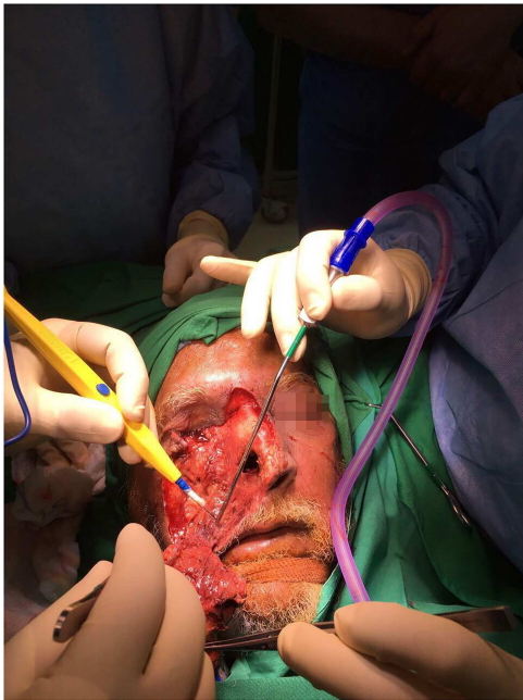
Figure 5: Intraoperative view of the debridement of necrotic tissue in the affected area in the right eyelids, right cheek and bridge of the nose. The paranasal sinuses were debrided endoscopically as well.

the orbital tissues are involved, the infection can rapidly cause permanent loss of vision and a potentially fatal extension to the brain [5].