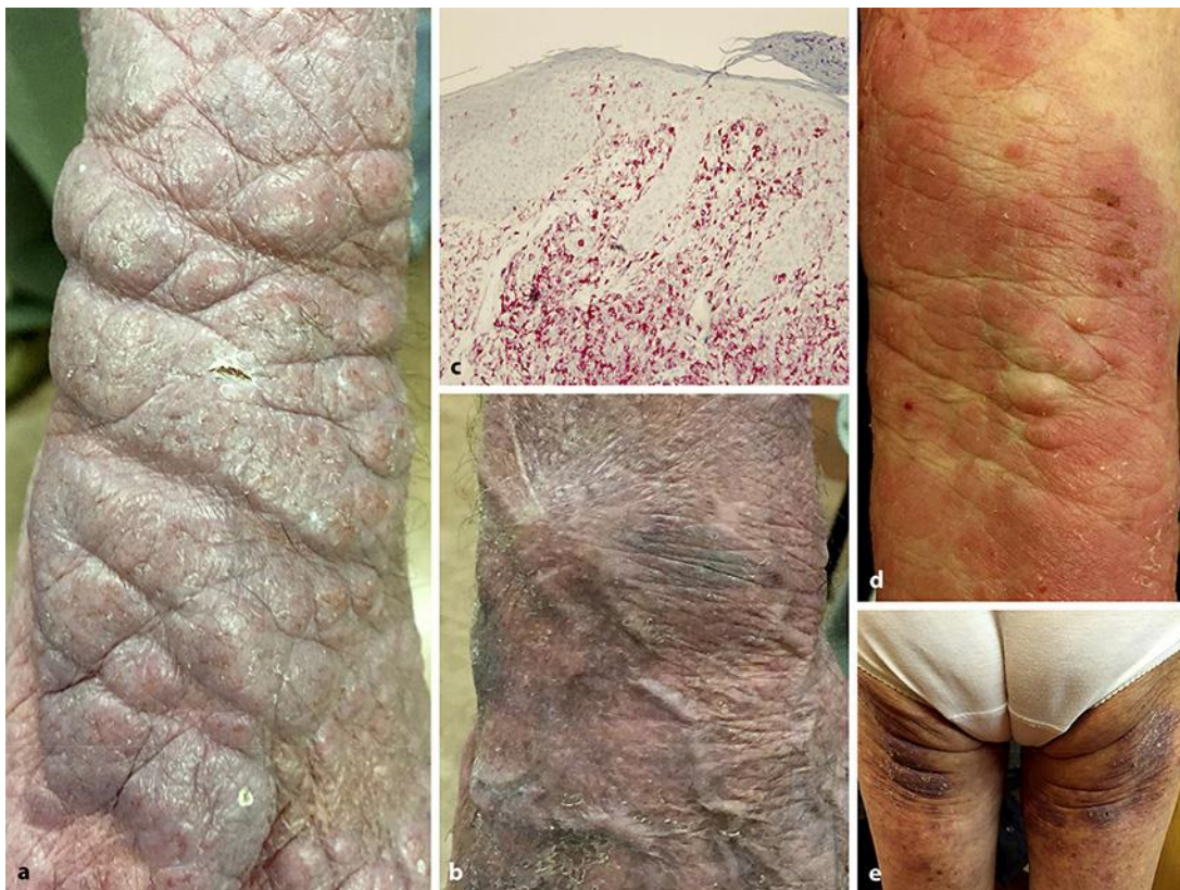
Fig. 1. a Pachyderma on the right arm. b Three weeks after treatment with oral steroids. c CD4+ rich and dense dermal infiltrate of atypical lymphocytes. d Pachyderma on the arm. e Bilateral pachyderma on the thighs.