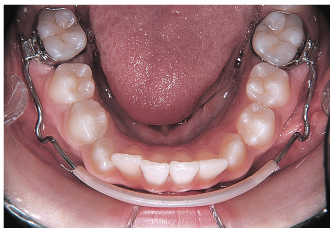
Figure 1 - Occlusal view of pre-fabricated lip bumpers with an acrylic shield extending from canine to canine and fitted on molar tubes.

To assess the movements of first mandibular molars and central mandibular incisors, mandibular superimpositions were performed using natural reference structures. 17 Radiographic tracings were oriented on the basis of: 1) anterior contour of the chin; 2) inner contour of the cortical plate at the lower border of mandibular symphysis; 3) distinct trabecular structures in the mandibular symphysis; 4) contour of the mandibular canal; and 5) lower contour of third molar tooth germ prior to root formation when the tooth was radiographically visible. Anterior and posterior stable structure reference landmarks were marked on pretreatment ( T_1 ) tracing and transferred to the superimposed post-treatment ( T_2 ) tracing.