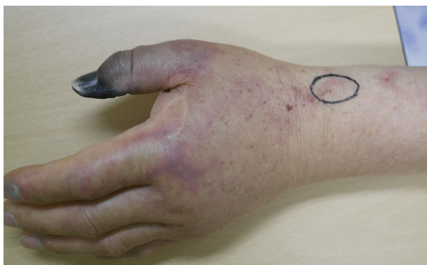
Figure 1 At the time of admission, necrosis of the left distal thumb phalanx was observed and an injection mark (black circle) was visible in the proximal portion of the radial styloid process.