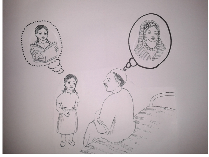
Figure 2 Example illustration from dissemination: limited autonomy and decision-making influence of girls and women.

Community dissemination meetings were hosted to 'member check' preliminary analysis<sup>16</sup>; this involved sharing research findings with study participants and those from the same or similar population groupings to confirm interpretations of the research team during analysis and to elicit further community reflections on the findings.<sup>14</sup> Visual methods were used in this process