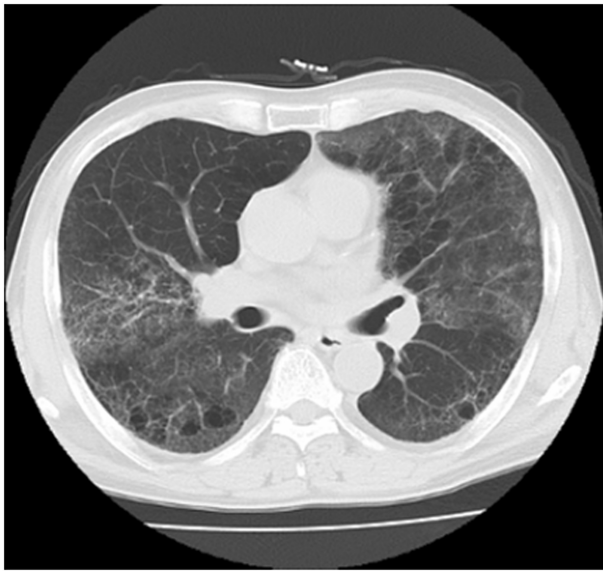
Fig. 1. Chest computed tomography showed bilateral pulmonary interstitial fibrosis, emphysema, several small calcified nodules that were scattered in the upper lung fields, and some calcified hilar lymph nodes.

oral prednisolone to a dose of 0.5 mg/kg/day and discharged the patient. His clinical course is described in Figure 2.