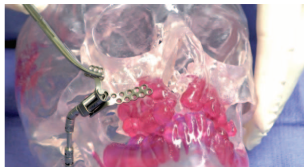
FIGURE 2. Device prebent on the three-dimensional model before application.

orbits, as shown in Figure 1. In these patients, midciliary incisions allowed access to the inferior orbital rims. After application of the transmaxillary plate to unite the maxilla into a single structural unit, the IMD devices were precisely bent to the contours of the maxilla on the sterile three-dimensional model (Fig. 2). This step included making sure that the proximal and distal plates were above the apices of the teeth and that the distraction vector would be parallel to the occlusal plane with as little convergence as possible.