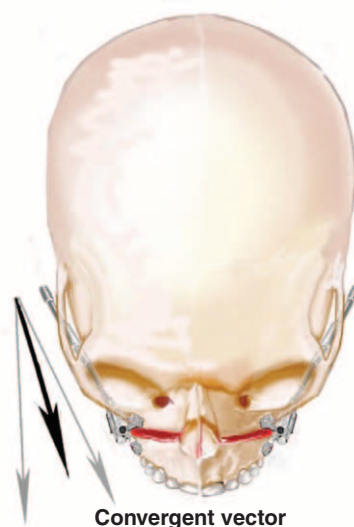
FIGURE 3. Correct distraction vector.

Correct Distraction vector parallels zygomatic arch