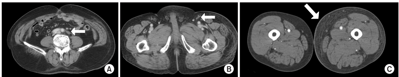
Fig. 1. Computed tomography of abdominopelvic area and both lower extremities. Normal lymph nodes (arrow) at the common iliac artery level (A) and left inguinal level (B). (C) Diffuse swelling (arrow) of the subcutaneous tissue in the left lower extremity at the thigh level.

On March 20, 2017, he was admitted to the rehabilitation department, and combined physical therapy (CPT) with manual lymphatic drainage and intermittent pneumatic compression was performed. Upon admission, laboratory examination showed a white blood cell count of 4,490/\text{mm}^3 , creatinine level of 0.64\text{ mg/dL} , albumin level of 3.4\text{ g/dL} , and C-reactive protein level of 0.30\text{ mg/dL} . He also received diuretics. After 10 days, the leg circumference difference decreased to 7 cm in the thigh and 3 cm in the calf. The patient was then discharged with diuretic medication. However, after 2 months, lymphedema aggravated and caused gait disturbance due to heaviness and tightness of the left leg. The leg circumference difference increased to 10 cm in the thigh and 7 cm in the calf.