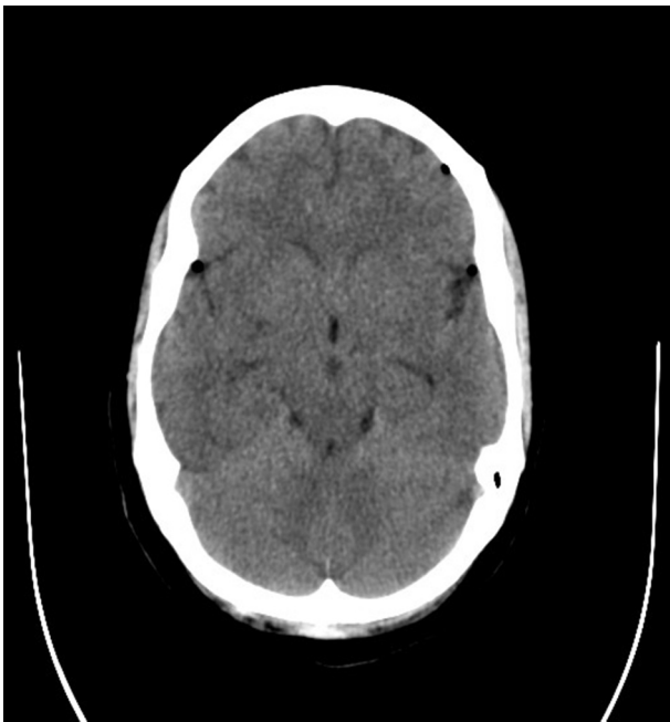
Figure 3. Axial Computed Tomography Scan

After six months of follow-up, she did not complain of any symptoms, and repeated CT scan revealed the absence of pneumocephalus.