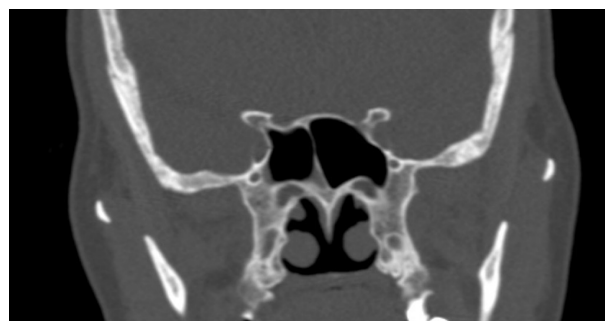
Figure 1. Computed Coronal Tomography

She was discharged ten days after the development of pneumocephalus. An additional CT scan of brain showed no air in the cranial cavity before discharge.