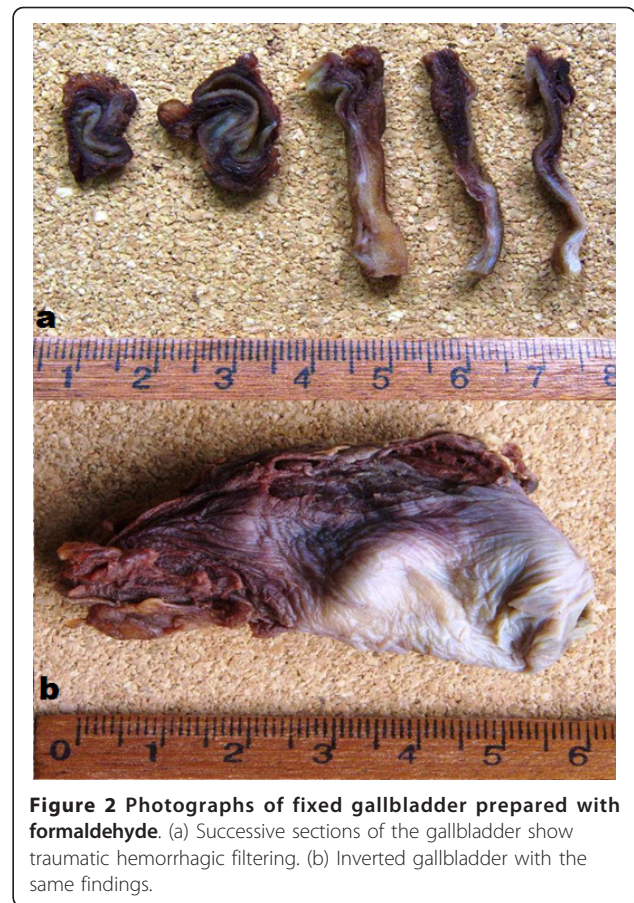
Figure 2 Photographs of fixed gallbladder prepared with formaldehyde. (a) Successive sections of the gallbladder show traumatic hemorrhagic filtering. (b) Inverted gallbladder with the same findings.