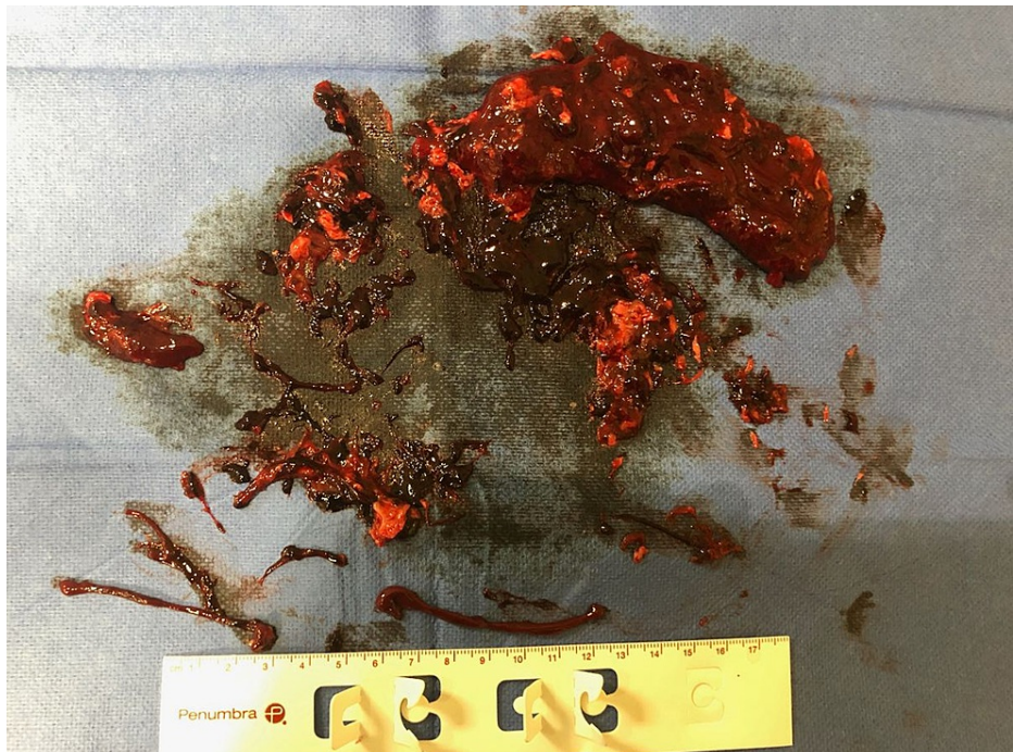
FIGURE 2: Gross finding of venous clot obtained from aspiration thrombectomy

Interventional Radiology was consulted and an aspiration thrombectomy of the DVT was performed the same day with the administration of 5000 units of heparin and 6 mg of tissue plasminogen activator (TPA). The fibrinous thrombus resected can be visualized in Figure 2. Due to persistent occlusive flow-limiting lesions, stents were placed in the external iliac and common femoral veins. Follow-up venography demonstrated patency of the stents and the patient was subsequently started on a heparin drip. However, the following day, a repeat USG showed a recurring DVT, along with thrombosis within the stents as depicted in Figure 3. The heparin drip was continued, and the patient was promptly transferred to the ICU and treated with a combination of USG-guided catheter-directed pharmacologic thrombolysis and mechanical thrombectomies. No residual flow-limiting stenosis or thrombus was seen on the venogram following this procedure.