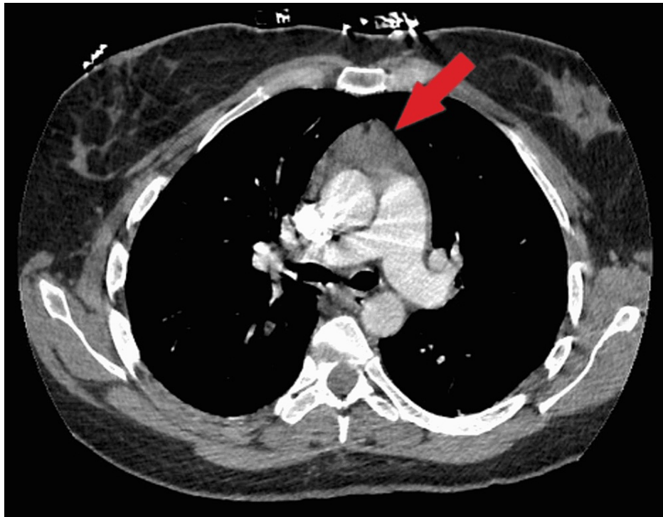
FIGURE 4: Incidental anterior mediastinal mass

On day five, the patient began to experience pleuritic chest pain and shortness of breath with tachycardia. Computed tomography angiography (CTA) demonstrated a large pulmonary embolus in a branch of the right lower lobe, along with an incidental soft tissue density measuring 2.4 x 4.4 mm visualized in Figure 4, concerning for a thymoma/ thymic mass. Given the need for multiple timed draws to measure Anti-Xa levels and activated partial thromboplastin time (aPTT) leading to difficulty in reaching adequate therapeutic goals on intravenous (IV) unfractionated heparin, she was switched to a weight-based twice-daily regimen of low molecular weight heparin (LMWH). Owing to the requirement for continued anticoagulation, a biopsy of the anterior mediastinal mass could not be performed during the patient's hospitalization.