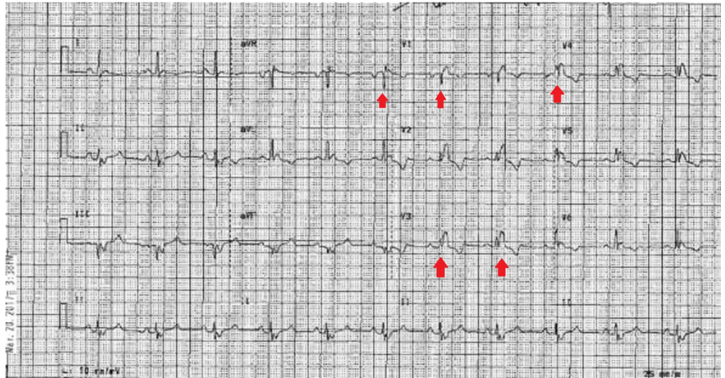
FIGURE 1: Electrocardiogram on presentation showing widened QRS complex with a right bundle branch block morphology

Transthoracic echocardiogram was consistent with progressive right ventricular dilation dysfunction and normal left ventricular size and function. Magnetic resonance imaging (MRI) was performed for further elaboration of the right ventricle (RV) and the pulmonary arteries. It revealed a dilated and dysfunctional RV, pulmonic valve insufficiency with dilated main pulmonary artery, focal stenosis of the left main pulmonary artery, and adhesions of heart to the chest wall (Figures 2-3).