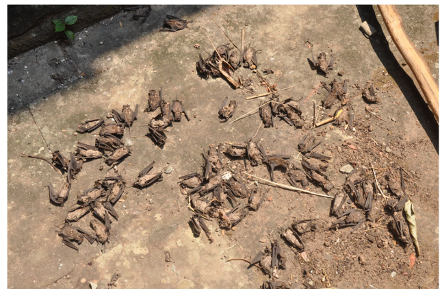
Fig. 1 Chaerephon plicatus female adult and pups found dead around the temple