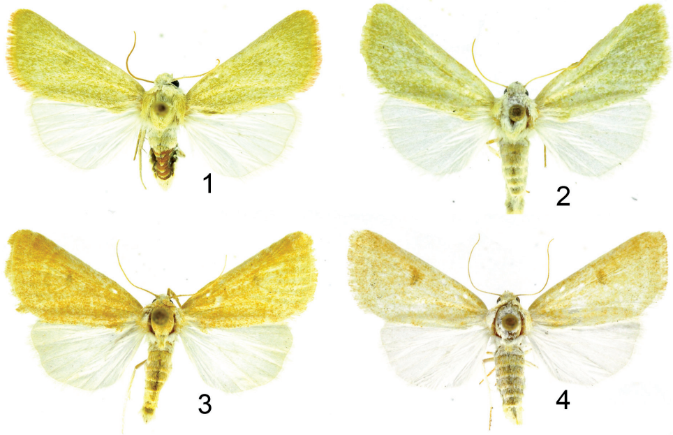
Figures 1–4. 1 Sparkia immacula (Grote) male 2 Sparkia immacula (Grote) female 3 Trichocosmia inornata Grote male 4 Trichocosmia inornata Grote female.