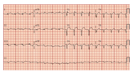
Figure 1 Presenting ECG suggesting anteroseptal ST-elevation myocardial infarction.

To cite: Desai CK., Bhatnagar U, Stys A, et al. BMJ Case Rep Published Online First: [please include Day Month Year]. doi:10.1136/bcr-2017-222463