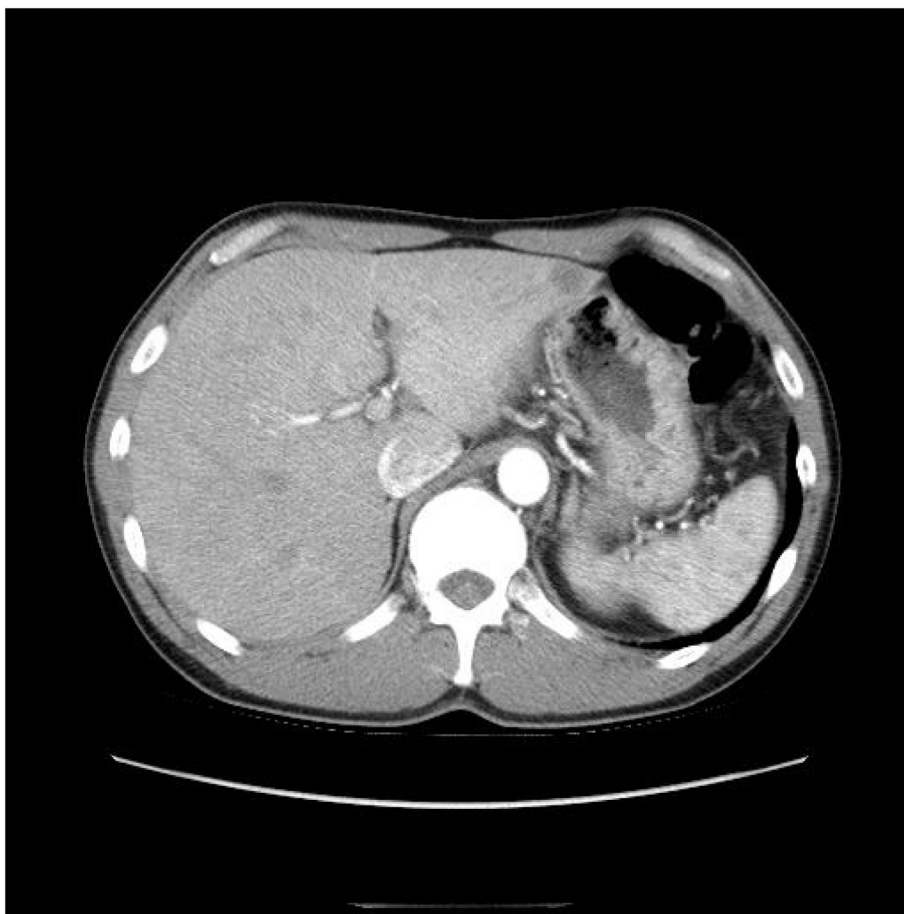
Fig. 4. Abdominal computed tomographic image, which was ordered from another hospital at a later date, showed a mass in the lateral portion of the liver. Cancer was diagnosed; the primary neoplasm was unknown. In the other hospital, percutaneous needle biopsy had been performed to determine the primary cancer.