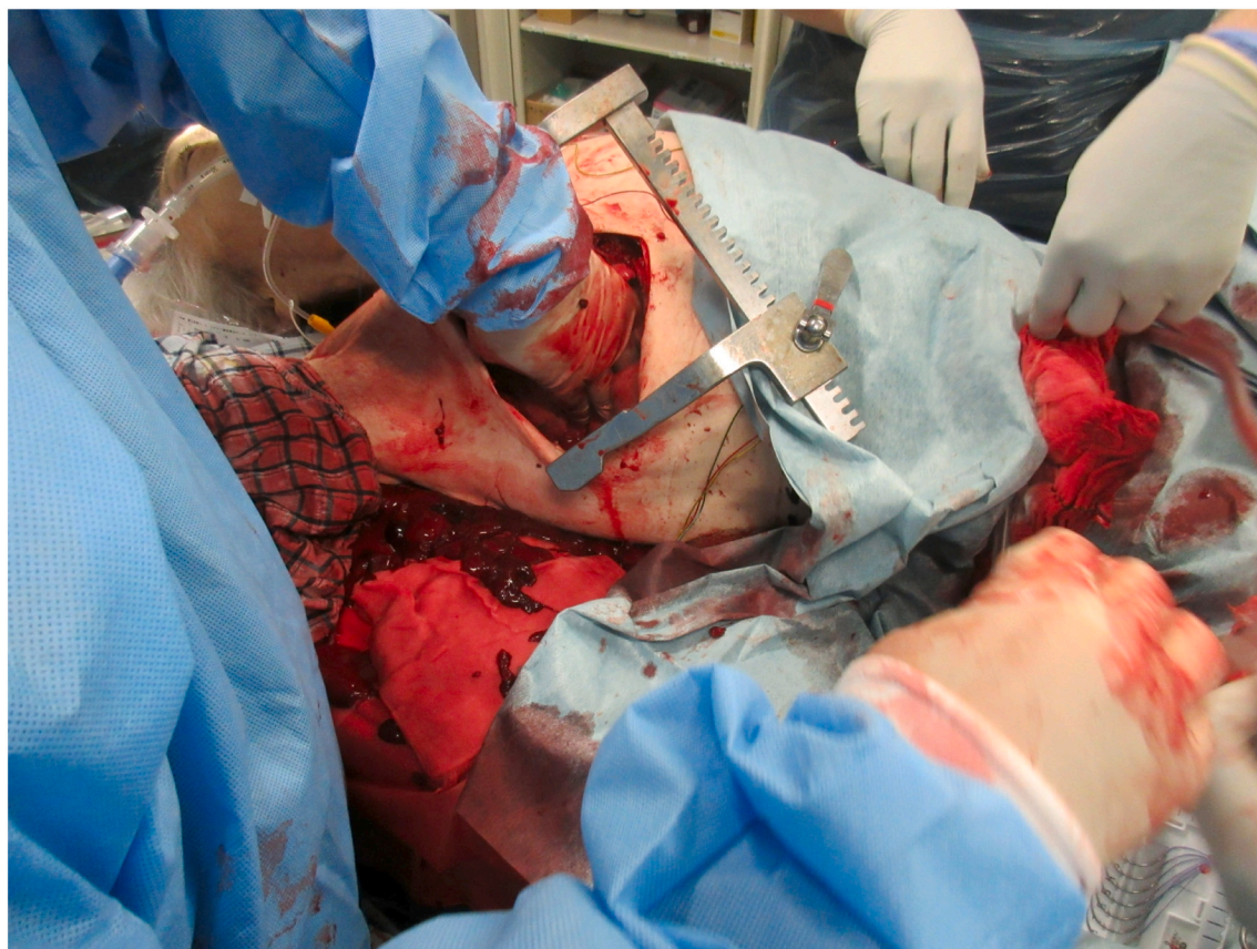
Fig. 2. Right thoracotomy was performed because of posterior pleural bleeding. A large amount of blood and many clots were observed.

bleeding, such as that caused by needle biopsy, do not cease spontaneously and are difficult to stop, and they can cause hemorrhagic shock and death.