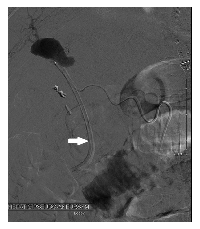
Figure 2: Angiography showing the hepatic artery pseudoaneurysm filling, with the arrow pointing to the catheter used for embolization.

Appropriate work-up for any gastrointestinal bleed begins with localization. In this case, the patient had both hematemesis and melena indicating a likely upper source. Esophagogastroduodenoscopy (EGD) is the next step that allows for both diagnosis and potential treatment of a bleeding vessel, ulcer or area of oozing. When blood is seen coming from the ampulla, concern for hemobilia arises [6]. A recent publication from the University of California illustrates the role of the advanced endoscopist as an alternate first-line therapy for hemobilia when found