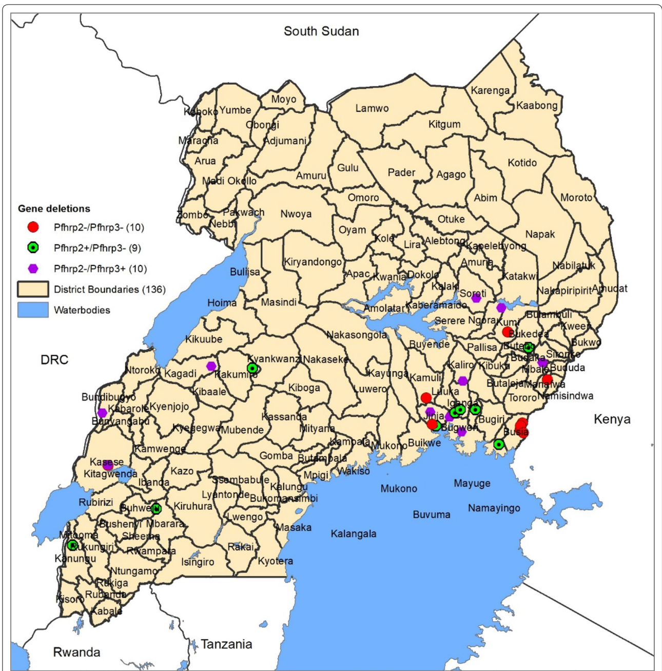
Fig. 3 Mapping the exact locations of pfhpr2 and pfhpr3 gene-deleted Plasmodium falciparum isolates. Exact location of collection sites for 29 gene-deleted P. falciparum parasites by latitude and longitudes coordinates. pfhpr2 -/ pfhpr3 + (indicated by red dots), pfhpr2 +/ pfhpr3 - (indicated by green circles) and pfhpr2 -/ pfhpr3 - (indicated by the purple hexagons)