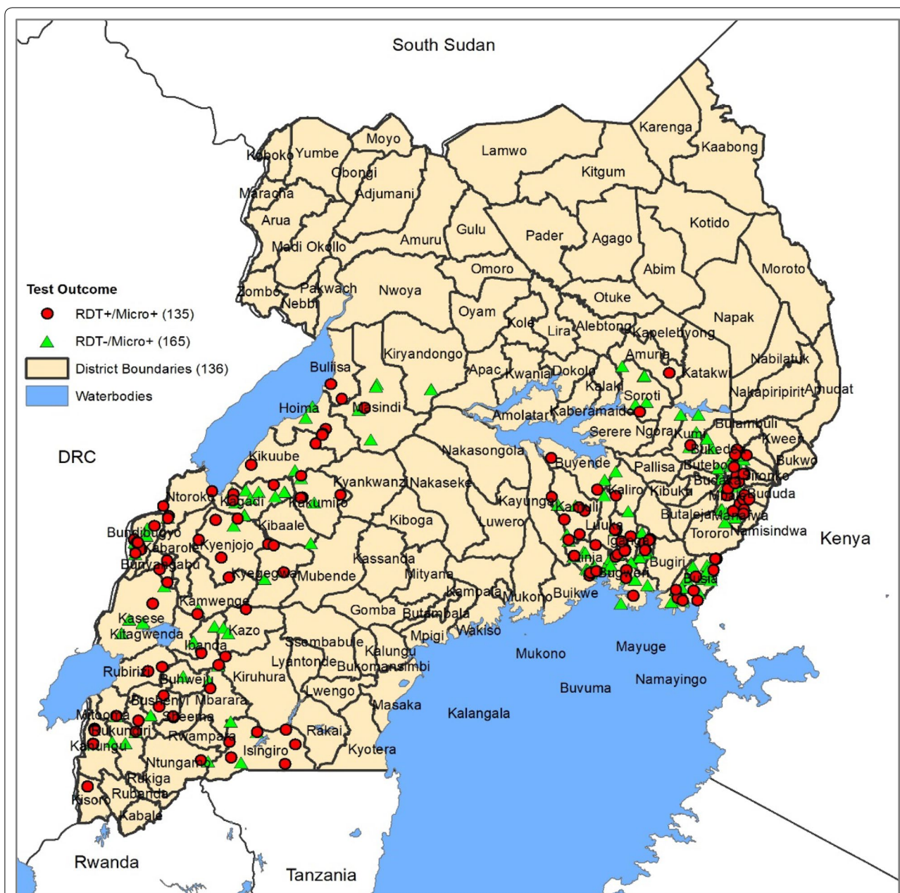
Fig. 1 Geographical information system (GIS) mapping and geographical distribution of sites where Plasmodium falciparum isolates were collected. Showing the location of sites where study samples were collected across 48 districts in eastern and western regions of Uganda. RDT-/microscopy+ (indicated by red dots) are samples that were RDT negative but microscopy positive. RDT+/microscopy+ (indicated by green symbols) are samples that were positive on both RDTs and microscopy

gene deletion analysis. The distribution of study samples (RDT-/microscopy+ and RDT+/microscopy+) across the study sites is shown in Fig. 1 and the study profile in Fig. 2. The majority of participants studied were male (52.3%) and were aged > 5 years (59.3%). Most participants were from the eastern region of Uganda 56.7% (50.9–62.4%). A majority of samples had parasite density \geq 1000/\mu\text{l} Table 1.