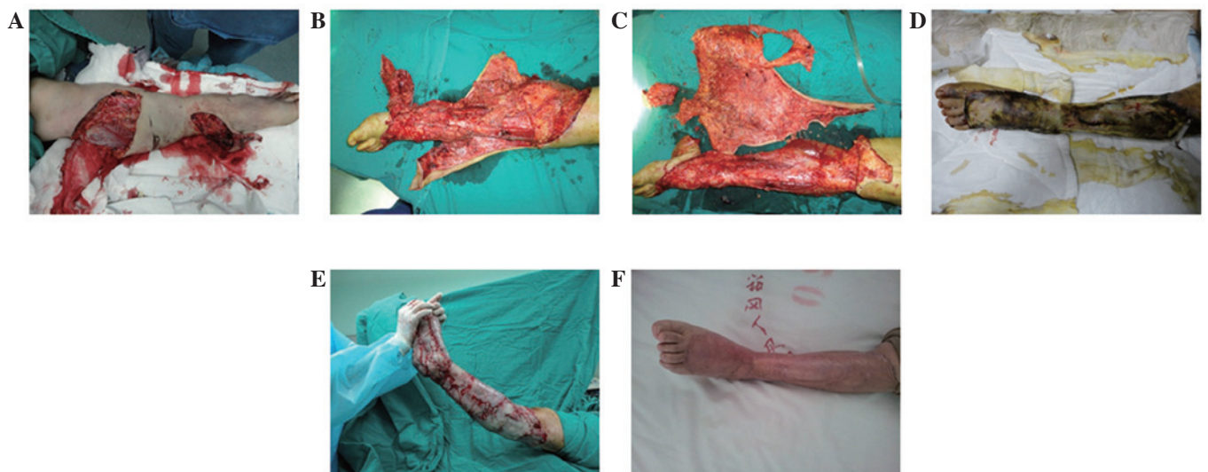
Figure 2. Case 2: Female, aged 45, admitted to hospital 4 h after a motor vehicle accident. Diagnosis: i) Avulsion of the left lower extremity; ii) fracture of the left tibia; and iii) hemorrhagic shock. (A and B) The skin and subcutaneous soft tissue below the left knee were stripped off and separated from the deep fascia. (C) The wound bed tissue became swollen following debridement. Furthermore, physiological structures and the normal tissues were mixed. Therefore, the success rate of skin grafting was likely to be relatively low. (D) A large sheet of XADM was used to cover the wound and several holes were opened in it for drainage. (E) The wound bed preparation was completed following 10 days of debridement. An autologous skin graft was subsequently performed for wound closure. (F) The follow-up was conducted one year following the surgery. Good recovery of the shape and function of the limb was exhibited. XADM, xenograft (porcine) acellular dermal matrix.