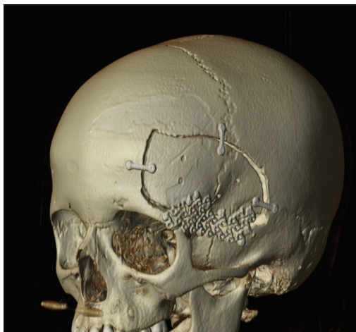
Figure 5: Postoperative CT scan showing left parietal cranioplasty