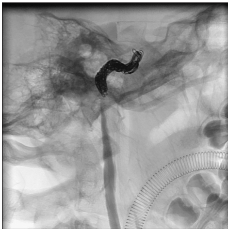
Figure 3: Angiography showing the embolised petrous part of the left ICA