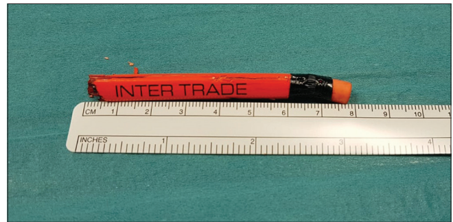
Figure 4: The pencil after removal in theatre