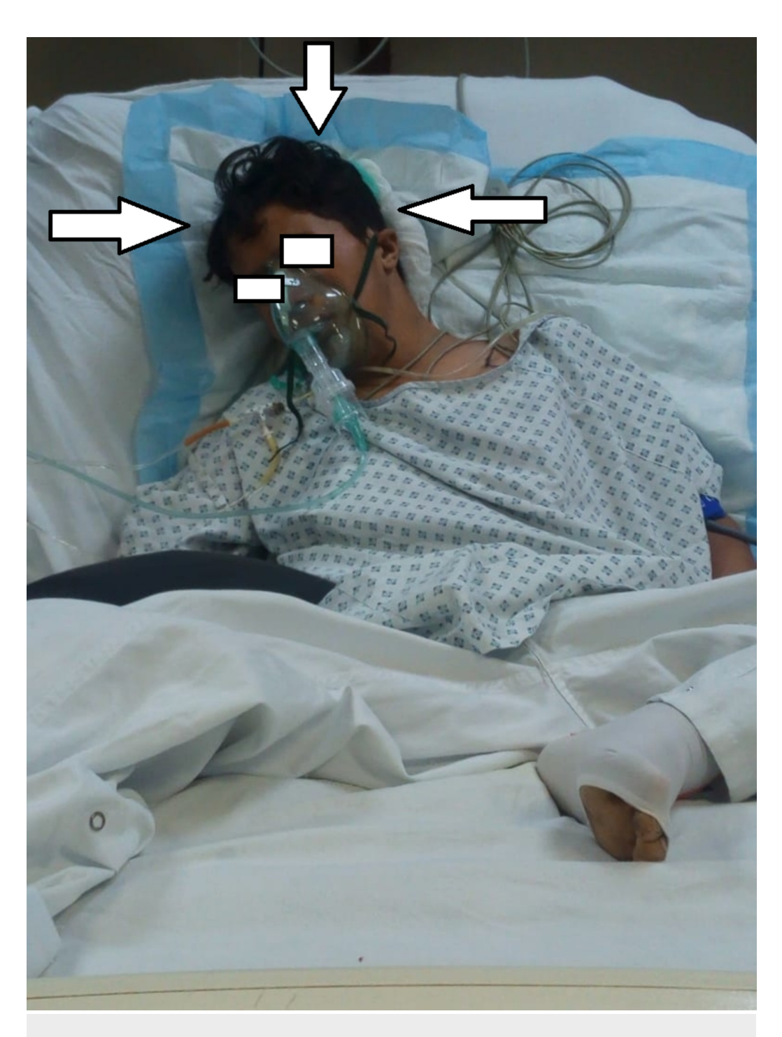
FIGURE 1: Patient admitted in the surgical ICU, Civil Hospital, Karachi