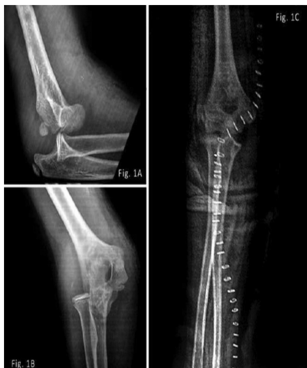
Fig. 1: 1A, 1B showing posteromedial dislocation of the elbow Fig. 1C post-reduction radiograph showing curvilinear incision closed with staples.