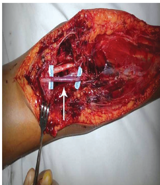
Fig. 3: Showing the transected brachial artery with reverse cephalic vein graft indicated by the blue tags.

which the brachial artery is entrapped between the rigid bicipital aponeurosis and the dislocated distal humerus.