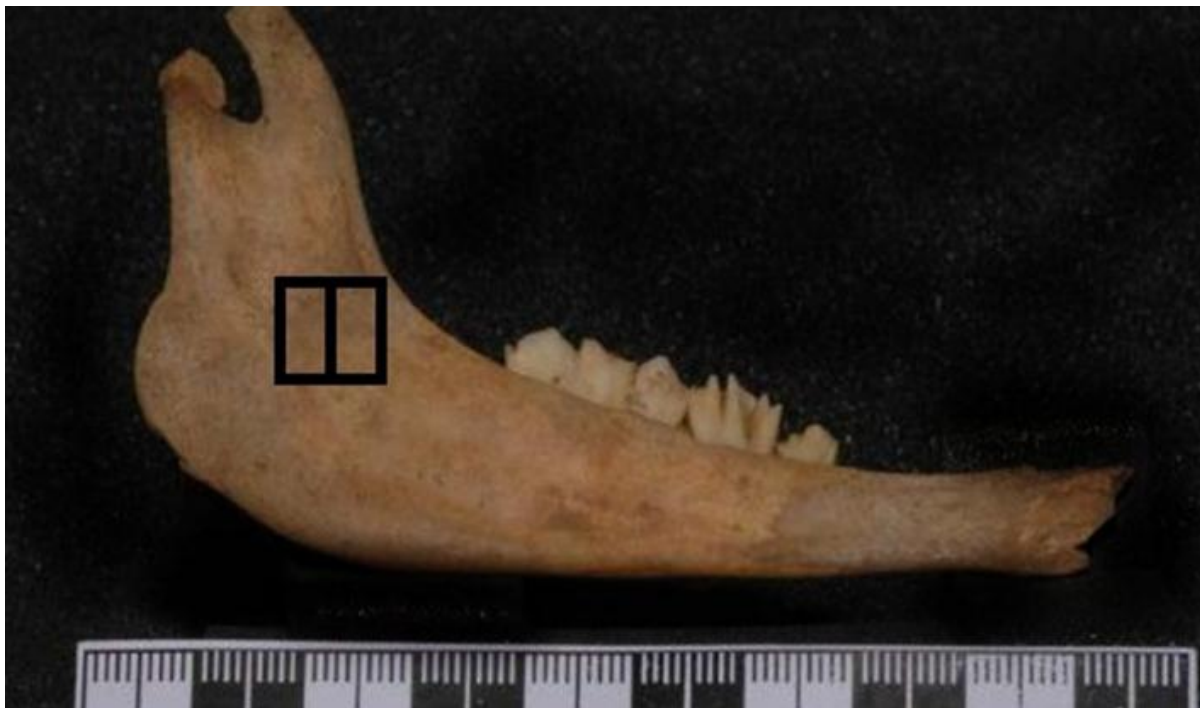
Figure 3: Measuring HU in one slice in the middle of the selected area