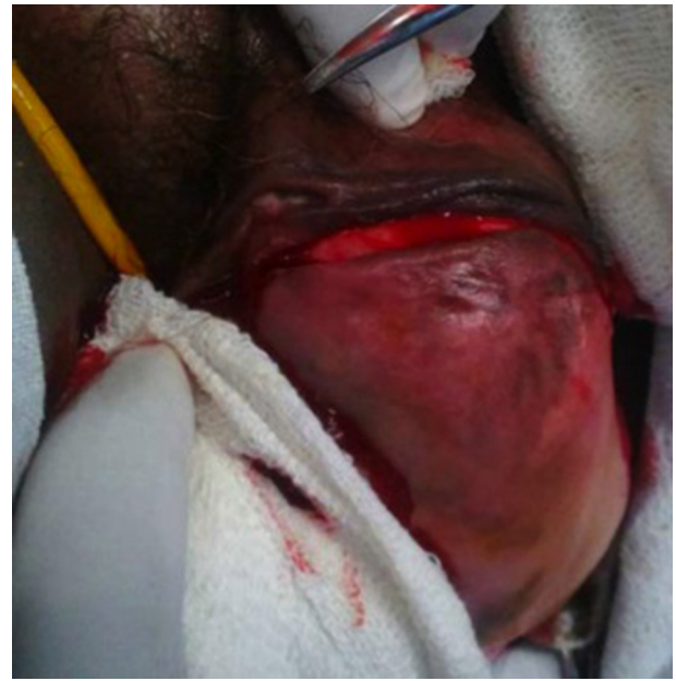
Figure 3. Intraoperative Photograph Showing Incision Over the Clitoral Mass With Preservation of the Tip of Clitoris

Thyroid function tests and chest X-ray findings were insignificant. Contrast enhanced computed tomography