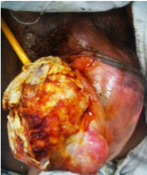
Figure 1. Large Fungating Clitoral Leiomyoma With Placed Urethral Catheter