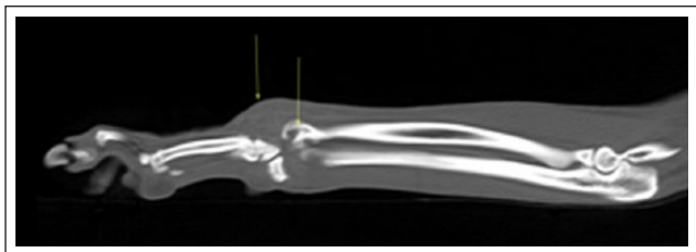
Figure 2 Sagittal multiplanar reformatted image of the left carpus of case 2. There is marked soft tissue swelling associated with the antebrachio-carpal joint. Osteolysis of the distal radius is also identified (arrows)