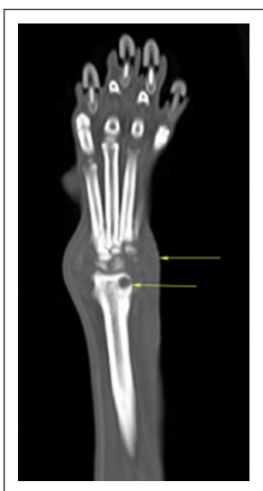
Figure 3 Dorsal multiplanar reformatted image of the left carpus of case 2. There is marked soft tissue swelling identified associated with the antebrachio-carpal joint (arrow). Smooth periosteal new bone is identified along the medial aspect of the distal radius. Marked osteolysis is identified, and particularly obvious in the lateral aspect of the distal radial epiphysis (arrow)

within the distolateral aspect of the radius and the inter-mediatoradial carpal bone consistent with osteolysis. Differential diagnoses included osteomyelitis/erosive arthritis (fungal, bacterial), atypical immune-mediated arthritis, mycobacterial infection and soft tissue neoplasia (eg, synovial cell sarcoma). CT of the right carpus was unremarkable. Enlargement of the left axillary lymph node was noted on CT, which was thought to be consistent with reactive or metastatic change. CT of the thorax revealed no abnormalities.