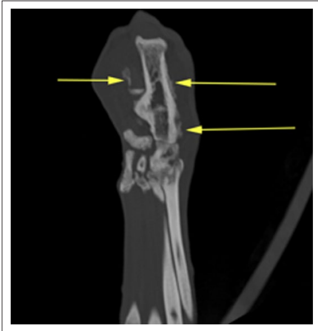
Figure 1 Dorsal multiplanar reformatted image of the left tarsus of case 1. A moderate periosteal reaction as described is identified (arrows)

around the talocrural joint (Figure 1). The lesion appeared intimately associated with the synovium. There were multiple pockets of non-contrast-enhancing soft tissue-attenuating material within the mass. CT of the chest revealed consolidation of the ventral aspect of all lung lobes. The consolidation occupied up to approximately two-thirds of each lung lobe. Air bronchograms were identified at the dorsal aspects of the regions of consolidation. The tip of the left cranial lung lobe was characterised by emphysematous changes. There was scant heterogeneous mineralisation of the lateral aspects of the right caudal lobe. There was also a mild tracheobronchial lymphadenopathy. These changes may have been consistent with previous severe liquid paraffin aspiration; however, concurrent disease (mycobacterial pneumonia) was also possible.