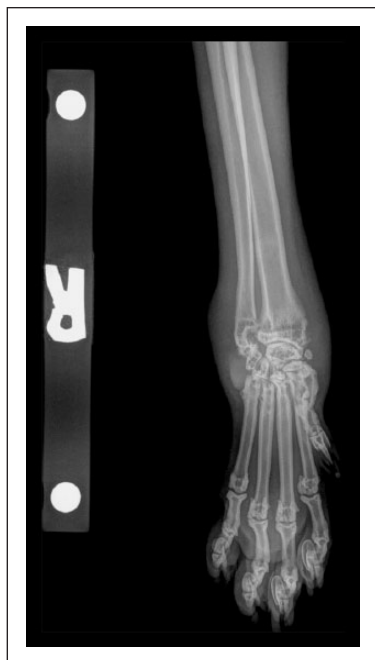
Figure 5 Dorsopalmar radiograph of the right antebrachiocarpal joint of case 4. There is marked soft tissue swelling associated with the antebrachiocarpal joint, as well as a smooth periosteal reaction along the distal radial metaphysis on the medial and lateral aspects. Focal regions of osteolysis are present within the medial aspect of the distal radial epiphysis

positive for M tuberculosis complex, confirmed to be M microti on GenoType MTBC assay (Leeds Teaching Hospitals Trust, Department of Microbiology).