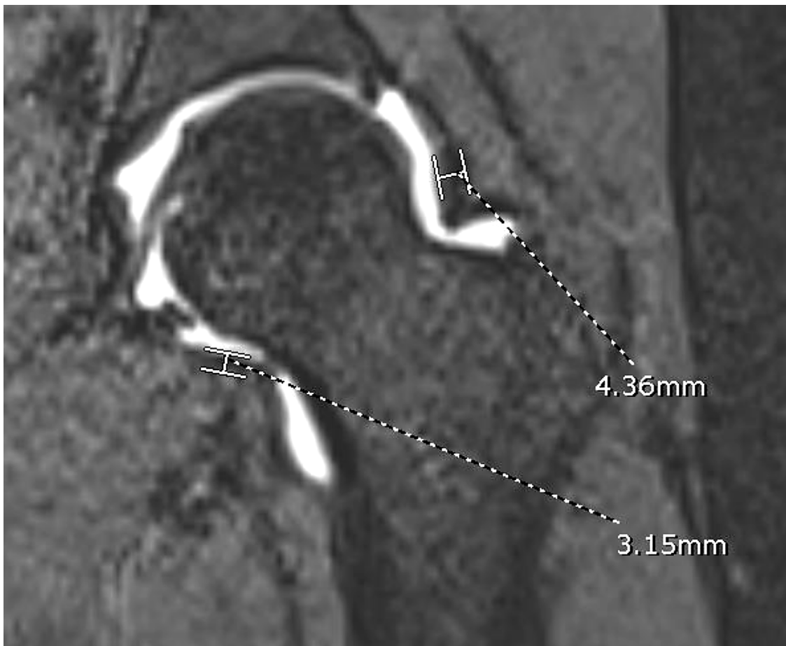
Fig. 2. Magnetic Resonance Arthrogram Coronal images showing superior and inferior capsule.