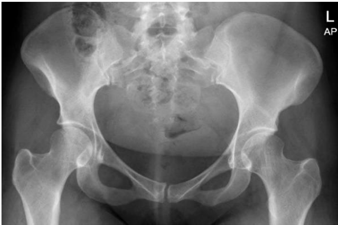
Fig. 1. Anteroposterior pelvis radiograph of the reported case.