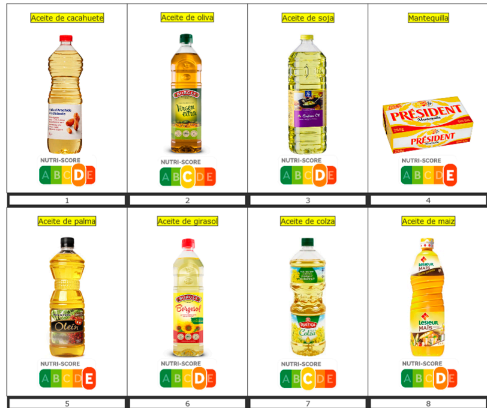
Figure 1. Pictures of the different vegetable oils and butter tested with their corresponding Nutri-Score from C to E.

perception and understanding of Nutri-Score. The present study focuses specifically on the questions related to perceptions of added fat. Pictures of seven vegetable oils and butter, with their corresponding Nutri-Score, were presented to participants (Figure 1).