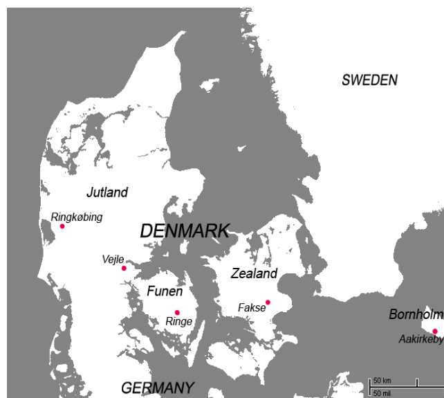
Figure 1 Geographic distribution of the five veterinary clinics in Denmark that provided canine blood samples.

The investigation was designed as a cross-sectional study, where dogs were used as sentinel animals and screened for presence of antibodies against TBEV. The study population consisted of clinically healthy dogs. Animals were recruited from five veterinary clinics from different regions of Denmark (Figure 1). Only dogs over the age of 4 years, and weighing more than 15 kg, were included because dogs of this age and size were more likely to have