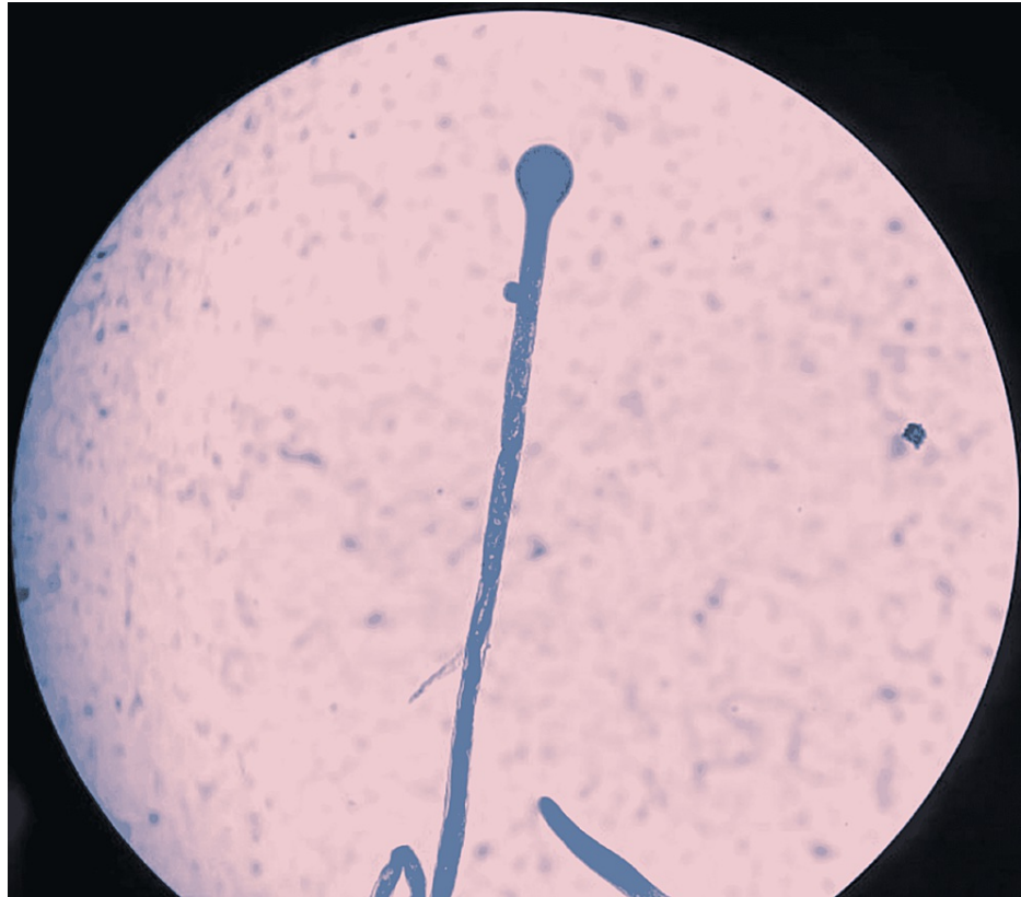
FIGURE 5: Microscopy of the growth under light microscope (40 x 10) showing broad non-segmented hyphae

She was admitted to the COVID-19 isolation unit. Her fasting blood sugar and the capillary blood sugar readings remained within normal range throughout. With the clinical suspicion, we started intravenous Liposomal Amphotericin 3 mg/kg/ day before the receipt of the biopsy report. A multidisciplinary team meeting was arranged encompassing the consultant physician, consultant ear, nose and throat surgeon, consultant microbiologist and consultant surgeon to arrive at a comprehensive management plan. For the mild COVID-19, considering a secondary bacterial infection (as evidenced by the patchy inflammatory shadow on the chest x-ray), we started Intravenous Ceftriaxone 1 gram twice daily and oral Clarithromycin 500 mg twice daily with the multidisciplinary consensus.