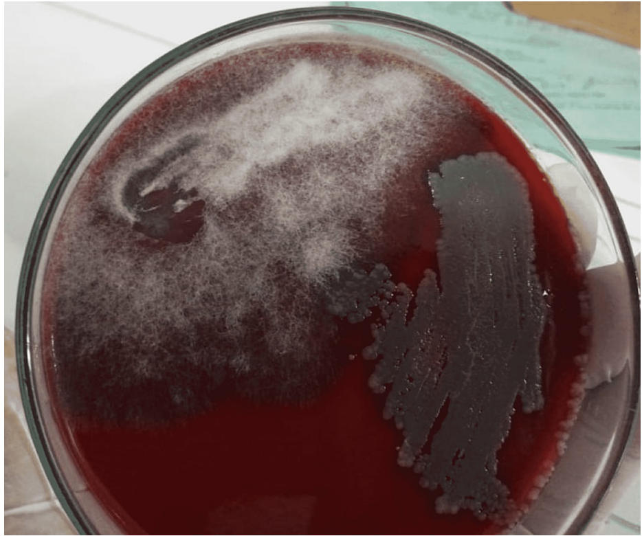
FIGURE 4: Sheep blood agar (SBA) showing colonies of filamentous fungal growth

Microscopy of the growth under light microscope (40 x 10) revealed broad non-segmented hyphae suggestive of mucormycosis (Figure 5). The culture was sent to the reference laboratory and was confirmed as mucormycosis species.