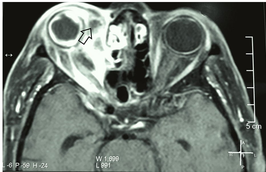
FIGURE 2: Magnetic resonance imaging of the brain and paranasal sinuses showing right-sided periosteal abscess formation

The magnetic resonance imaging of the brain and sinuses was done to evaluate the extent of the involvement. It revealed right-sided orbital subperiosteal abscess formation (Figure 2) with evidence of right-sided frontal, maxillary and ethmoidal sinusitis (Figure 3).