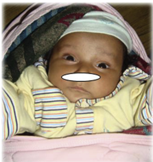
Fig. 4. The comfortable child after treatment for RE SHAPU.