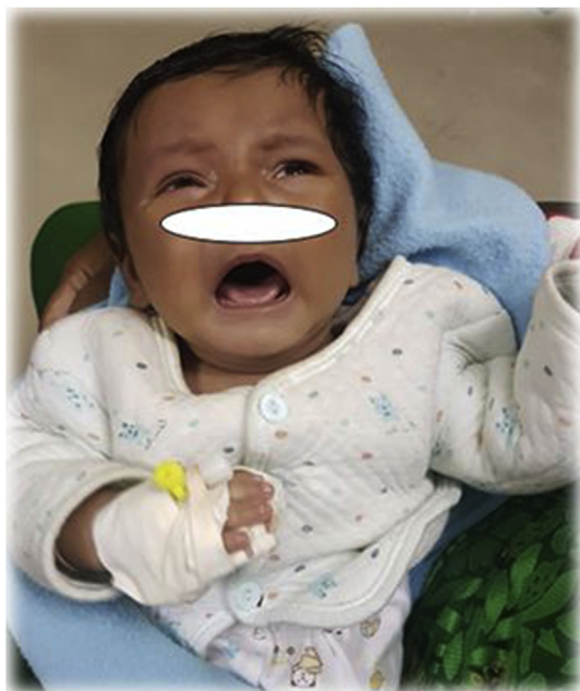
Fig. 1. A 38-day-infant with SHAPU at presentation with affected right eye.