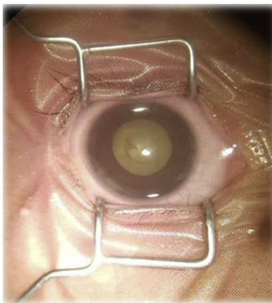
Fig. 2. Congested right eye with leukocoria.

and Dexamethasone also given at the end of the surgery. The child was maintained on topical antibiotics and corticosteroids eye drops with cycloplegics.