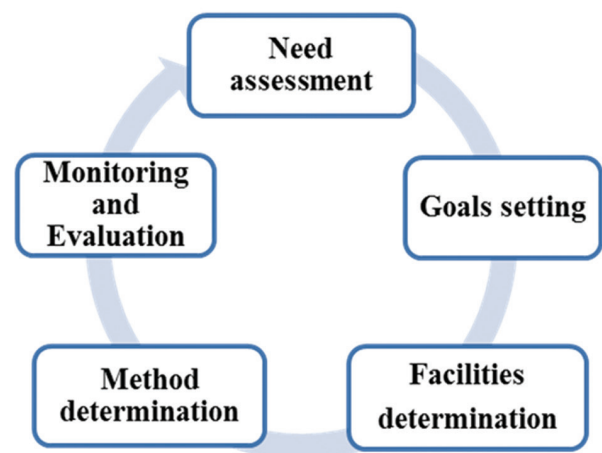
Figure 1: Development and implementation of smart investment

As mentioned, smart investment in the field of noncommunicable diseases will have a direct impact on the economic, political, social, and cultural dimensions. The health system's performance in the field of noncommunicable disease will be promoted if the fundamental steps toward smart investment are taken. Smart investment steps are shown in Figure 1. The stages of the development and implementation of smart investment planning can include the dimensions described in Table 1 encompassing all aspects of noncommunicable disease. In the early phases of smart investment, one must know the idea and get the right understanding of the investment. In the field, all stakeholders are justified to understand investment procedures and to provide basic information. The health department should provide a simple, systematic, and organized solution for smart investment in noncommunicable diseases field and those solutions with regard to the current and future status. The smart investment describes the dilemmas and tips and points out how to ask smart questions from investment advisers and experts, and to set clear goals and to make the right decision in noncommunicable diseases field.