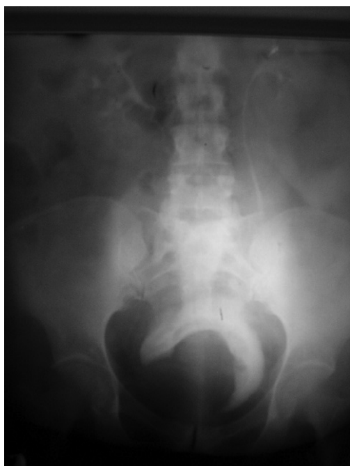
Figure 1. IVU Shows Normal Kidneys With Large Mass in the Base of Bladder

Cystoscopy: large tumor in right hemitrigone and bladder neck with intact bladder mucosa and varicose vessels in the bladder neck and base of the bladder