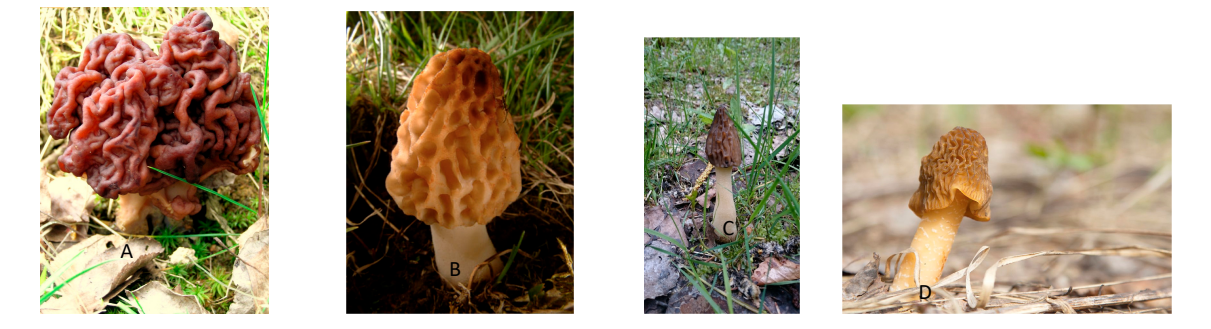
Figure 1. Pictures of some False and True morels. ( A ) The False morel Gyromitra esculenta which has a wrinkled, brain-like cap. ( B ) A true yellow morel, Morchella esculenta , which has a honeycomb cap attached at its basis to the stipe. ( C ) Morchella semilibera , a true black morel ( =Mitrophora semilibera ). ( D ) The false morel Verpa bohemica , which has a wrinkled and subdimpled cap, put like a thimble over a finger and without any attachment at its basis to the stipe. For species recognition, colour being variable, specific morphological traits is a basis for differentiation between Gyromitra sp. and Morchella sp. At the contrary, Verpa bohemica and Morchella semilibera , have similar traits.