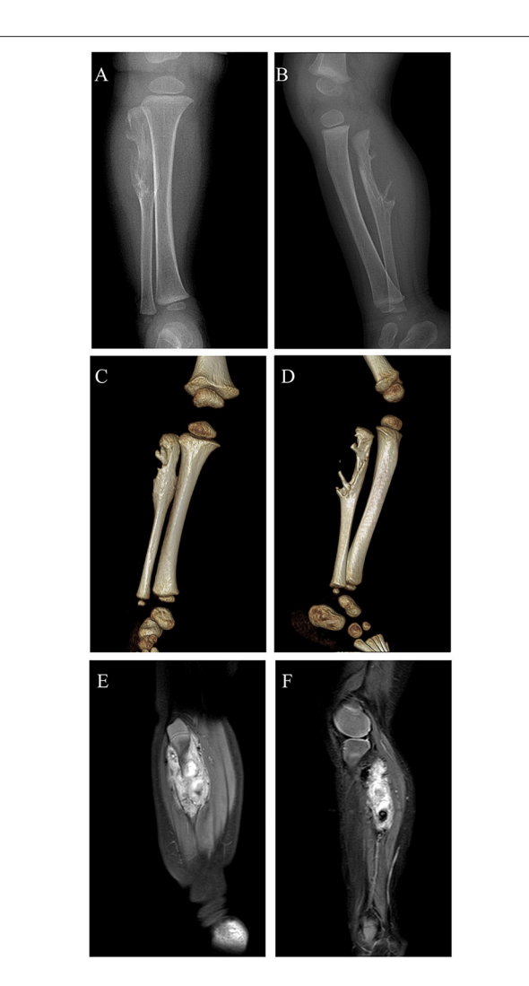
FIGURE 1 | Digital radiograph preoperatively: (A,B) Radiographs of the right tibia and fibula showing an irregular bone destruction of proximal fibula; (C,D) 3d CT reconstruction demonstrating lytic bone destruction of right proximal fibula; (E,F) MRI revealing a massive vascular tumor with surrounding soft tissue hyperplasia and involvement of the proximal fibular epiphyseal plate.