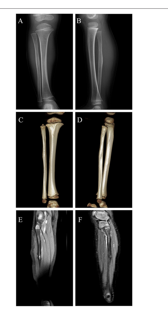
FIGURE 4 | Digital radiograph at 2 years postoperatively: (A,B) Radiographs showing reformation of the cortex of the proximal fibula; (C,D) 3d CT reconstruction demonstrating both uniform bone mineral density and continuous cortical of right proximal fibula; (E,F) MRI revealing remarkable regression of lesion without evidence of local recurrence.

In conclusion, for SCH of fibula with partial bone destruction, intralesional curettage renders a safe and efficient intervention at early stage. Meanwhile, our study was limited by lacking further evaluation for treatment approaches owing to small sample size.