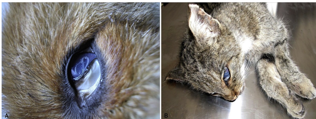
Fig. 1. Adult specimens of Thelazia callipaeda on the eye of a red fox (A), and a wild cat (B).

From the 16 species of Thelazia eyeworms, which are localized in the conjunctiva, lachrymal ducts and surrounding structures of animal hosts, two species, namely Thelazia callipaeda and Thelazia californiensis Price, 1930 (Spirurida, Thelaziidae) parasitize a wide range of animal hosts including carnivores, lagomorphs and humans. While these nematodes cause mild clinical symptoms in infested animals (e.g., conjunctivitis, epiphora, ocular discharge, keratitis) and rarely severe corneal ulcers and blindness, the zoonotic potential of T. callipaeda is of concern, mainly in rural areas of Southeast Asia (Shen et al., 2006; Otranto and Dutto, 2008) where, according to some molecular investigations, the parasite was originated (Otranto et al., 2005). Scientific information about T. californiensis is limited and uncertain also for the scarce number of reports from Western USA (California) in dogs, cats, coyotes, bears and humans (Doezie et al., 1996). In a unique case, T. californiensis adult nematodes were morphologically and genetically diagnosed in a Swiss patient after a stay in Northern California (Grimm and Deplazes, personal communication). Information about the vector of this eyeworm species is lacking, however, the little house flies Fannia canicularis and Fannia benjamini (Diptera, Fanniidae) have been