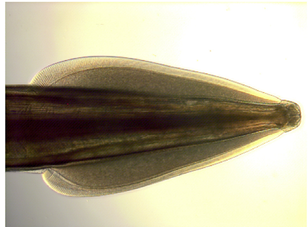
Fig. 2. Anterior edge of Toxocara cati from the gut of a wild cat. The short and wide cervical alae give the typical appearance of an arrow.

In felids, T. cati (syn. Toxocara mystax ) is mainly transmitted by predation of paratenic hosts or ingestion of infectious eggs. Infection with large numbers of T. cati eggs during the last third of gravidity in female cats results in the trans-mammary transmission of infective larvae to the kittens (Coati et al., 2004), however, the epidemiological significance of this way of transmission for wild felids is not confirmed (Fig. 2). In Europe, T. cati is highly prevalent in the domestic cat populations that have free access to the environment and to potentially infected paratenic hosts (Giannelli et al., 2017). Furthermore, large populations of feral or stray cats represent the main reservoir for the maintenance of the T. cati life cycle. A variety of wild felids are susceptible to T. cati intestinal infections, with a report in an Iberian lynx