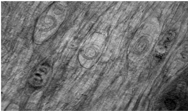
Fig. 4. Encapsulated larvae of Trichinella britovi in the striated muscular tissue of a fox.

19%; Ancylostoma pluriidentatum , 29%) Mclaughlin et al. (1993) suggested that this wild felid could serve as a zoonotic reservoir of hookworms.