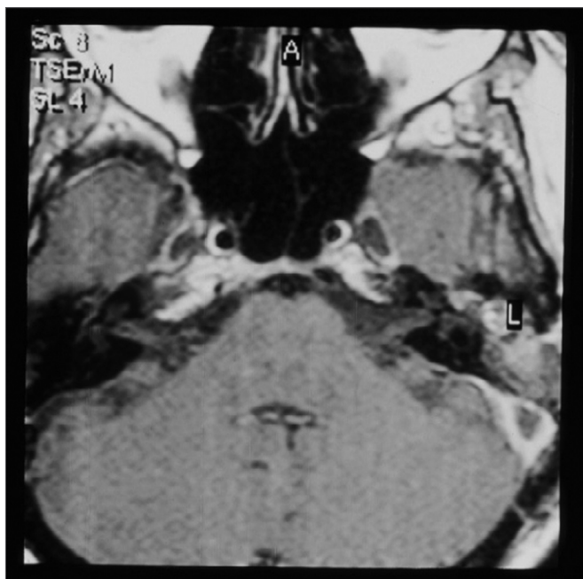
Figure 4. Temporal bone contrasted MRI, showing contrast highlight around the sigmoid sinus and no highlight inside, suggesting that there is a thrombus inside.

thrombosis, and better to assess blood flow, it may even show sinus obstruction outlining the lesion contours and the involvement of adjacent structures (Figure 4); however, for diagnostic confirmation we need MR angiography or arteriography. Classically, the arteriography is considered the exam with the best sensitivity and specificity for SSST diagnosis, however it does bear some restrictions because it is invasive and there is always the risk of contrast allergy. The MR angiography exam is much more sensitive than the CT scan 5,6,10 and less invasive than arteriography in SSST diagnosis, that is why it is our favorite exam and it is currently used as a routine in our institutions in cases we suspect of SSST.