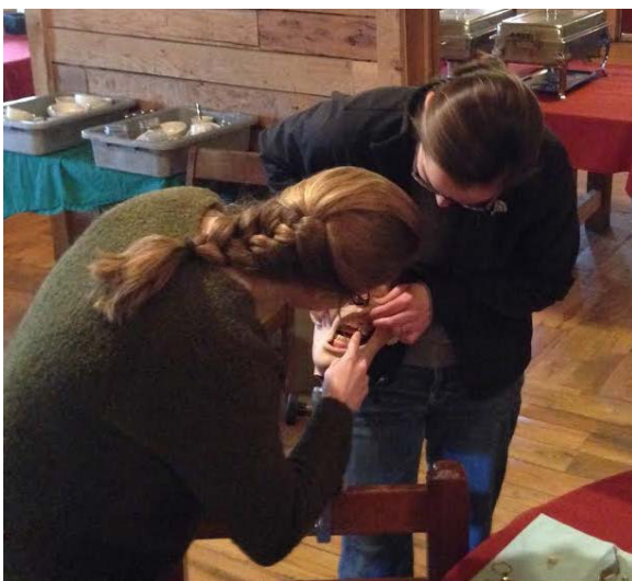
Figure 1. A student and instructor performing procedures at the dental extraction station.

Attendees were given an identical questionnaire prior to the initial lecture and after completion of the workshop