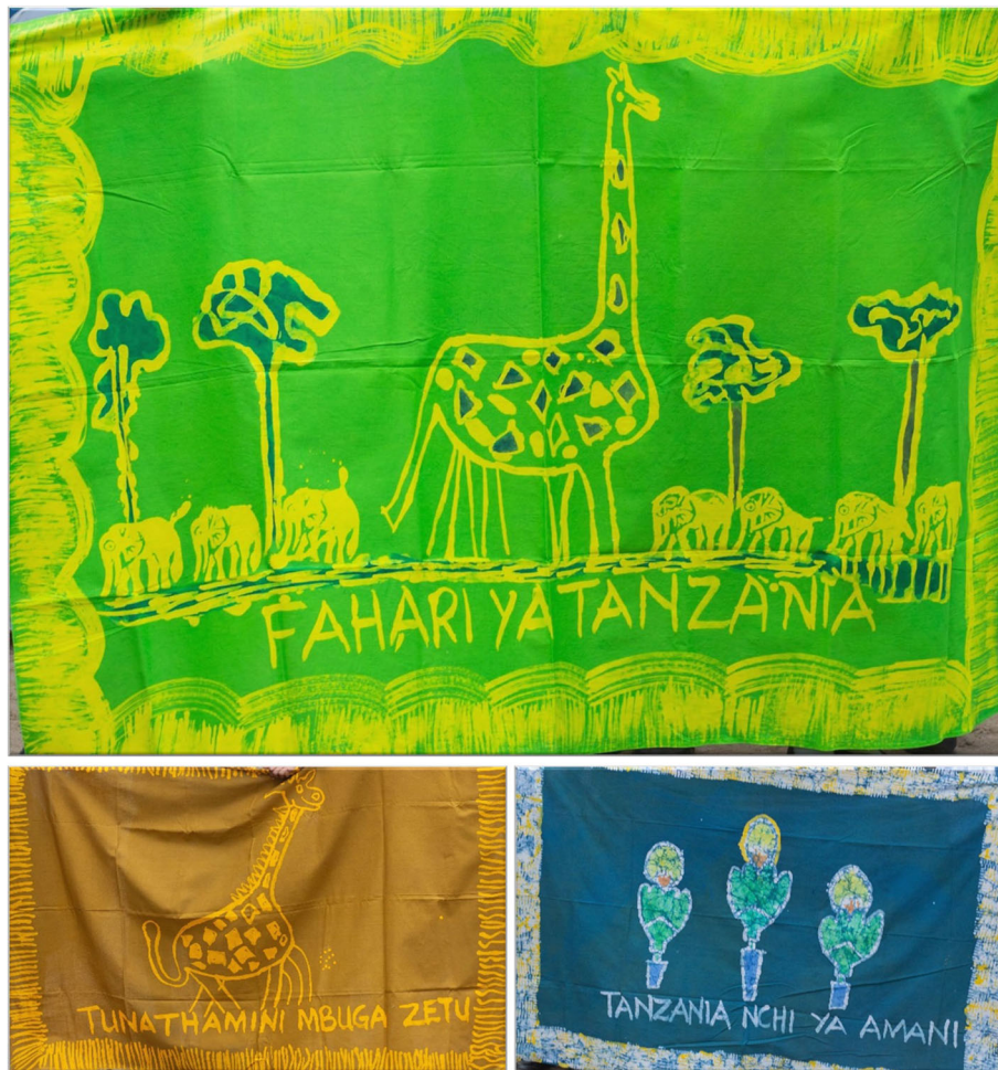
Translations: Top— The Pride of Tanzania Bottom left— We value our national parks ; Bottom right— Tanzania, a country of peace