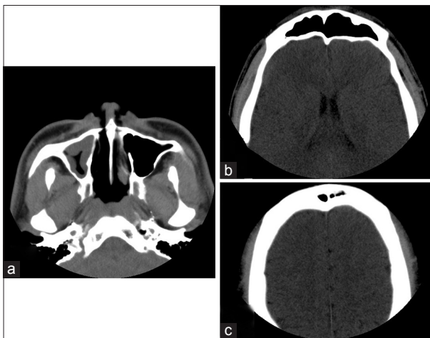
Figure 1: Computed tomography taken at the first consultation. (a) There was a fluid collection in the right maxillary paranasal sinus. (b and c) There were no abnormal findings in the cranium

According to them, the incidences of cerebrovascular disorder were 4.6%–19.9%, [7-9] and most of them were ischemic diseases (68.2%–100%). [2,7-9] On the other hand, the incidences of pure-hemorrhagic complication were 0%–3.3%. [5,7-10] In these reviews, we excluded cases of hemorrhagic infarction from pure-hemorrhagic complication. [7-10] Furthermore, micro-bleeding in T2* and hematoma with abscess were also excluded. [10] In cerebral hemorrhage, ICH and SAH were included. ICH was found in various parts of basal ganglia or subcortical. Several articles clarified that once hemorrhagic stroke occurred, the mortality rate was extremely high (63%–66.6%). [5,10]